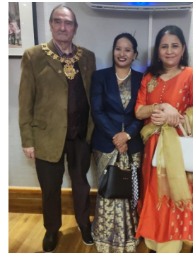
The Deputy Mayors meet (left & centre)