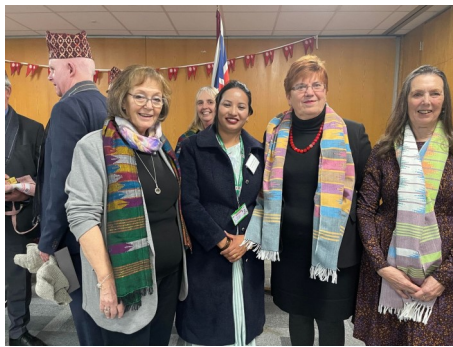
The Deputy Mayor meets RIA Members