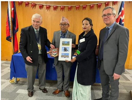
The Mayor meets the Mayor

Here are some pictures, which capture some of the key moments, including a memorable visit to the 24ft Wind Tunnel.