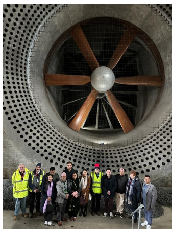
The 24ft Wind Tunnel with FAST Guides in high vis. jackets