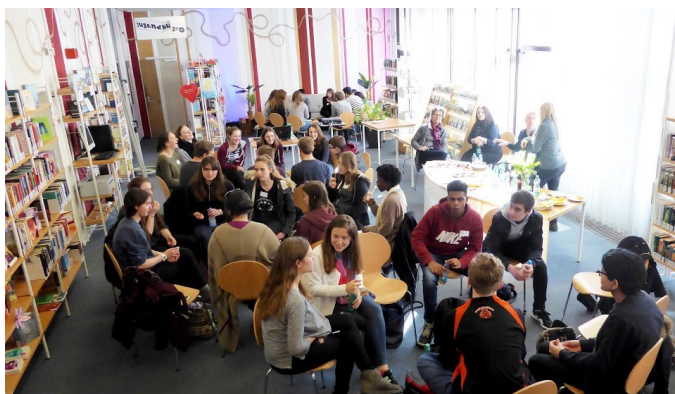
Youth Forum for English and German students in Oberursel's library